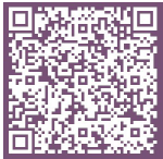
Fabric Warranty T&Cs