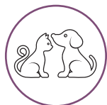
Pet Bodily Fluids