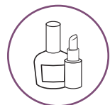
Nail Polish, Lipstick