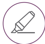
Pen, Ink, Marker