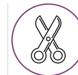
Rips, Tears, Cuts