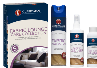
Small Fabric Care Collection Kit. Products provided only with self-application warranties